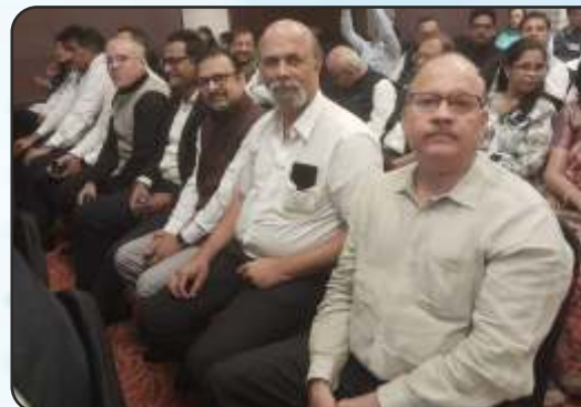
Our Members at TRF Seminar