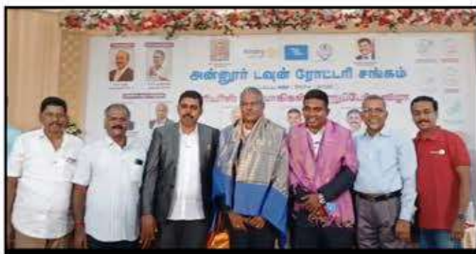
Our Club Rotarians attended RC Annur Installation