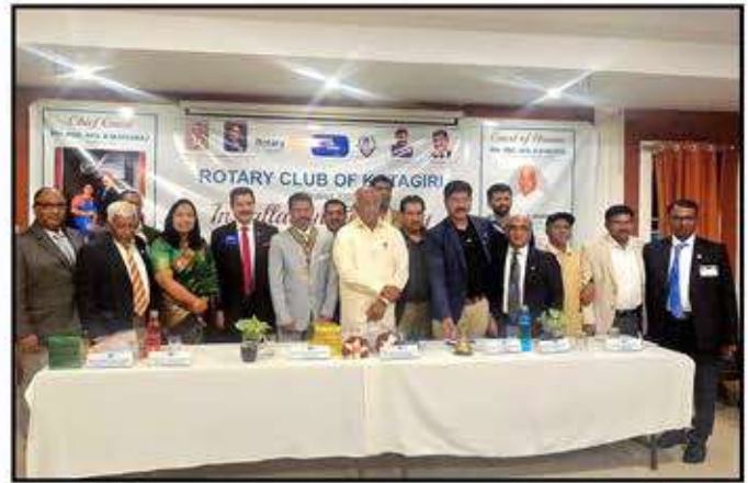
Our Club Rotarians attended RC Kotagiri Installation