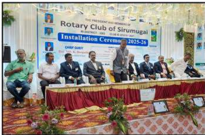
Our Club Rotarians attended RC Sirumugai Installation