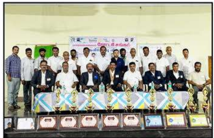
Our Club Rotarians attended RC Vagarayampalayam Installation