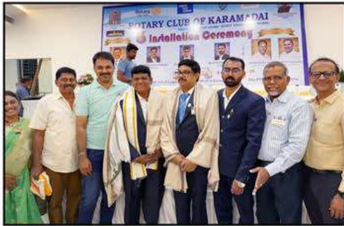
Our Club Rotarians attended RC Karamadai Installation